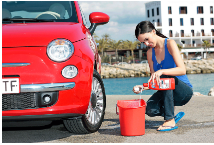
ar care with wash & wax