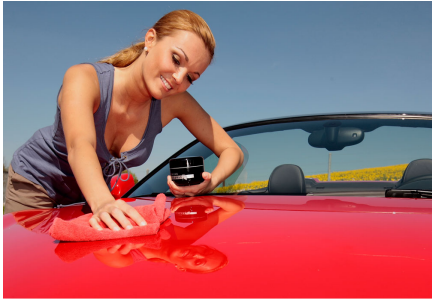
Care care with carnauba wax