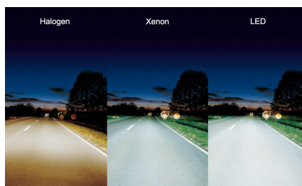
Example of halogen, xenon and LED lighting