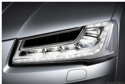
LED headlights from hella