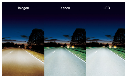
Example of halogen, xenon and LED lighting

Lighting-based driver-assistance systems prevent drivers in oncoming traffic from being dazzled when the high beam is activated.